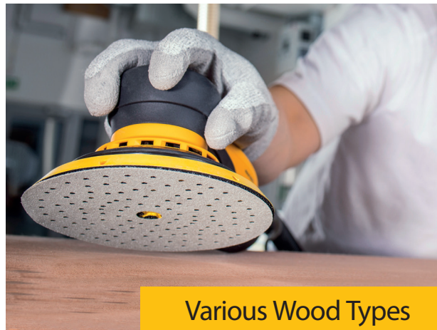
Various Wood Types